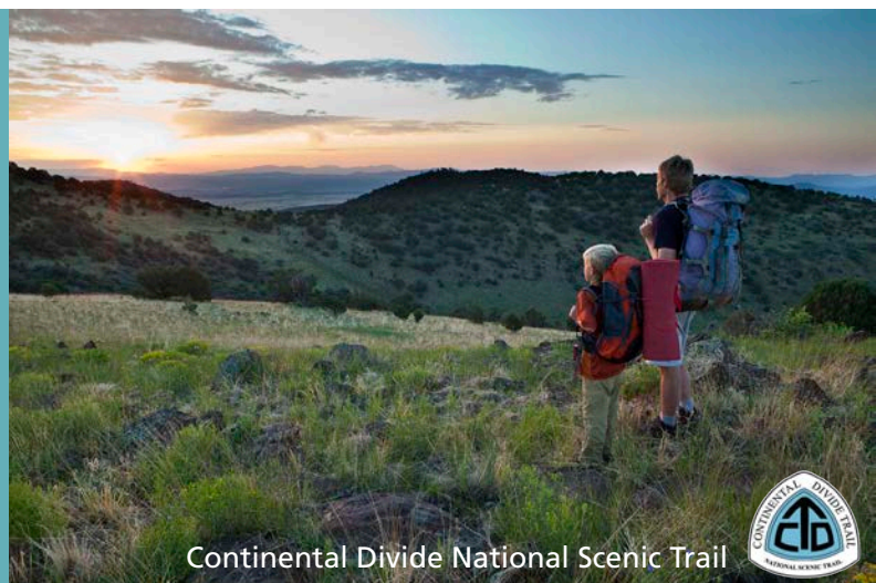
Continental Divide National Scenic Trail