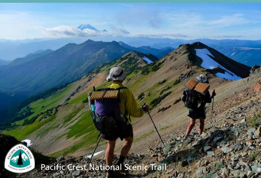
Pacific Crest National Scenic Trail